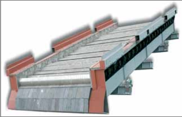
Above the grate: The grate for the waste-to-energy plant TAS in Kolding