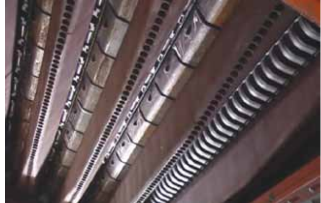
Below the grate: No flex tubes below the grate